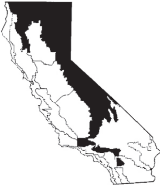
Figure 1: Climate Zone 16 (Pacific Energy Center 2006)

The proposed measure applies only to Climate Zone 16, a map of which is shown in Figure 1. This proposed measure would save energy in the relatively cold Climate Zone 16 by adding insulation to the thermal boundary where heat is lost when outside temperatures and ground temperatures are lower than inside the building envelope. The code specifies that where it is required, “the minimum depth of concrete slab floor perimeter insulation shall be 16 inches or the depth of the footing of the building, whichever is less.” This proposed measure does not change this depth requirement.