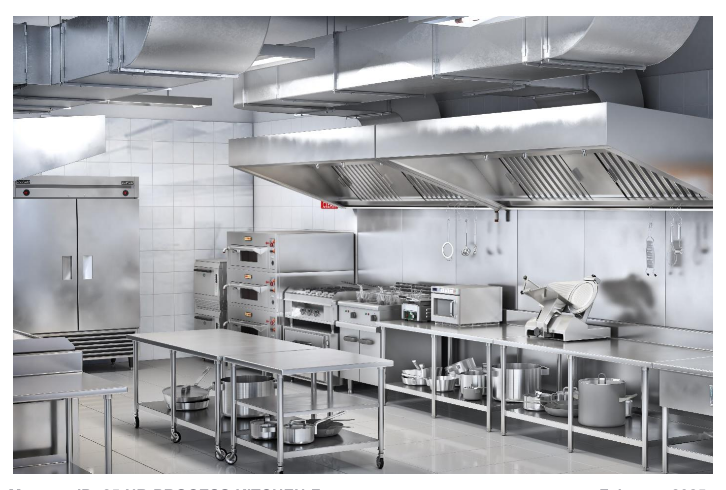
Measure ID: 25-NR-PROCESS-KITCHEN-F Covered Process